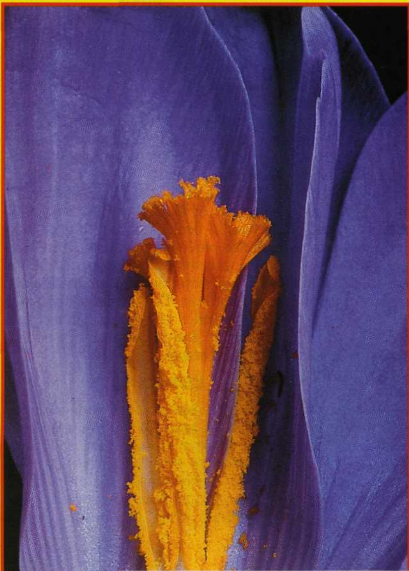
Kodak Gold Plus 100