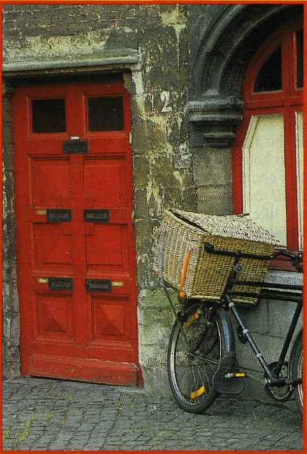
Kodak Gold Plus 200