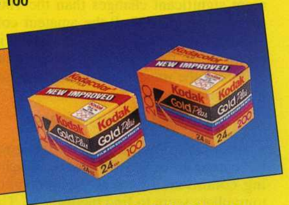
Kodak Gold Plus 200