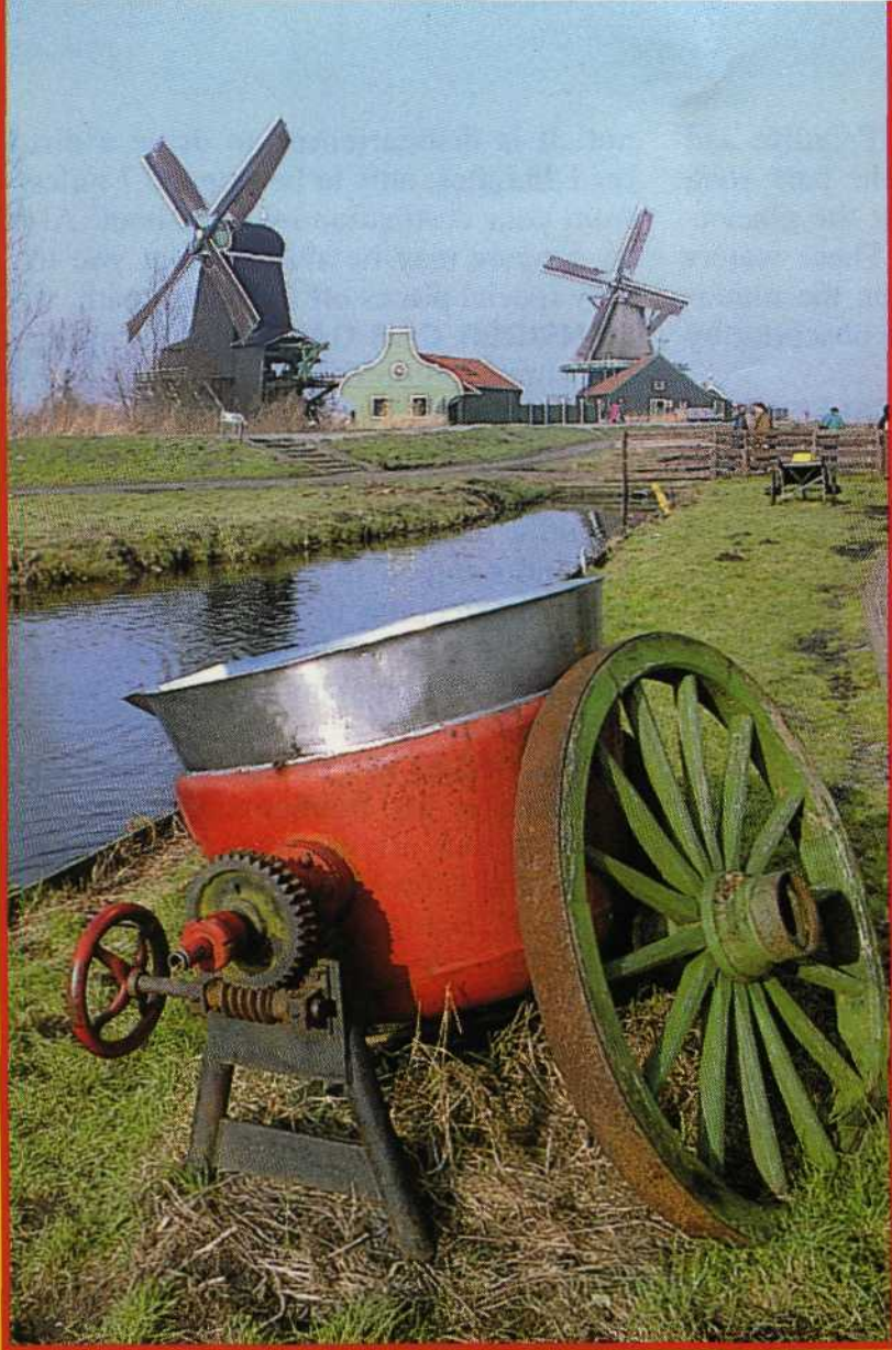
Kodak Gold Plus 100