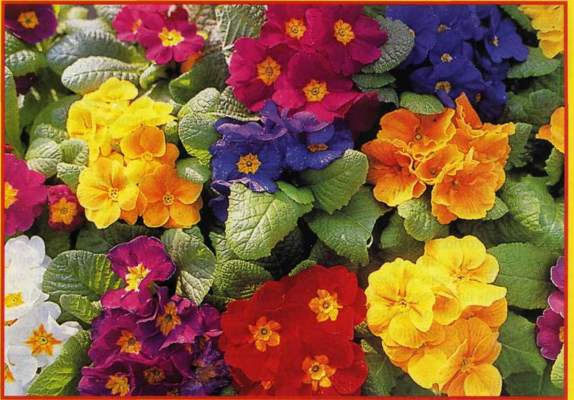
Kodak Gold Plus 100