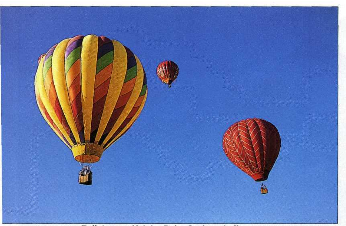
Fujichrome Velvia; Palm Springs balloon race