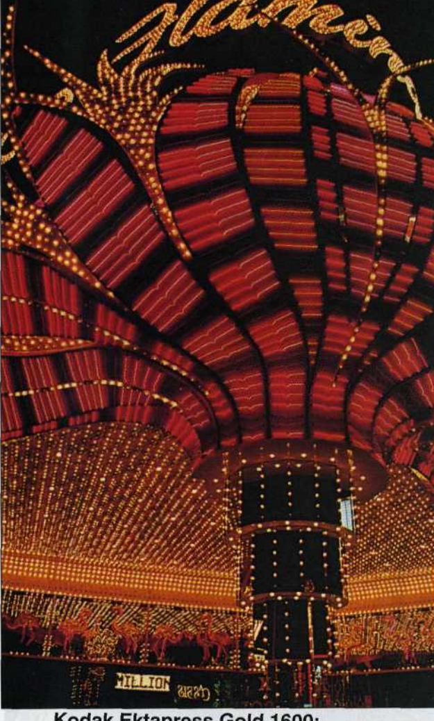
Kodak Ektapress Gold 1600; Las Vegas, Nevada