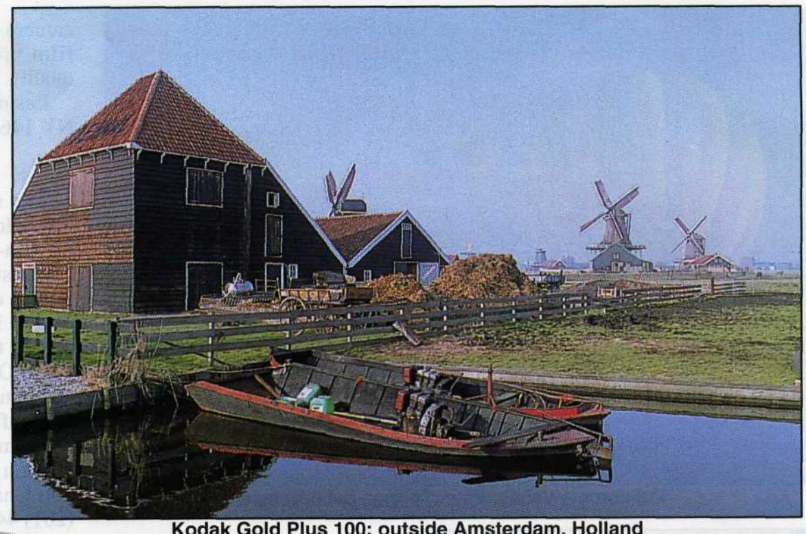
Kodak Gold Plus 100; outside Amsterdam, Holland