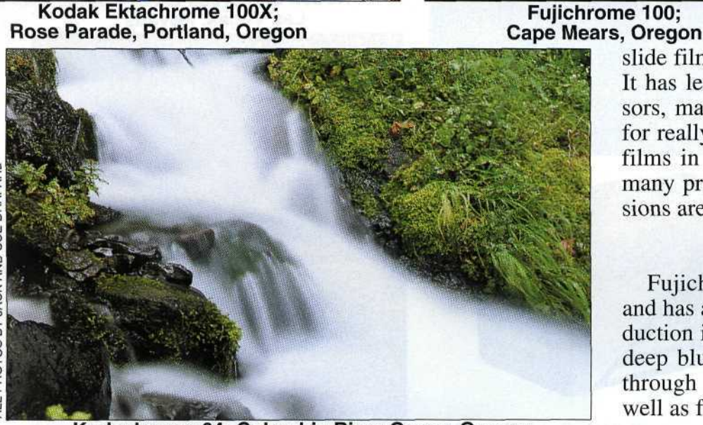
Kodachrome 64; Columbia River Gorge, Oregon

camera and lens, hold it steady, and expose the film properly, you'll get unbelievable image