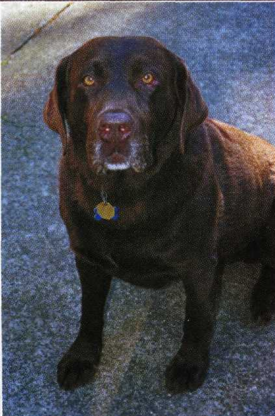
PHOTOGRAPHY BY JACK, SUE, AND KRISTY DRAFAHL

Kodak's new Advantix 400 is a tremendously versatile color-print film for Advanced Photo System users that has the speed and performance to handle just about any shooting situation. It's a great general-purpose film for shooting indoors or out, by existing light or with flash. The extra film speed gives you sharper pictures when you use the telephoto end of your camera's zoom lens, and when shooting in dim lighting, because it causes the camera to use faster shutter speeds, reducing the effects of camera shake.